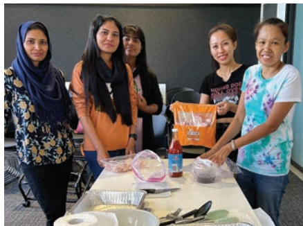
Palmerston AMEP clients cooking up a storm after a morning gardening in Harvest Corner Community Garden (April 2023)